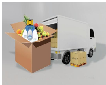
put into the box/cartons