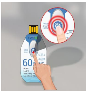
press the button to start